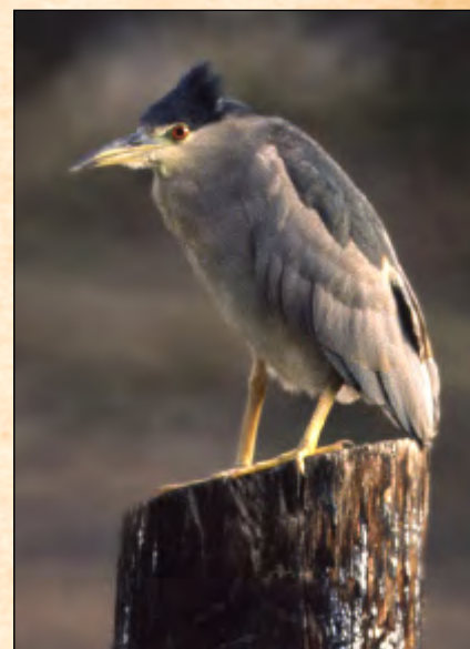
Black-crowned Night Heron by Don Shoemaker

Chapter members attending the April 29 tour and visit to Chatsworth Nature Preserve were treated to over seventy species of resident, summer nesters, and migrant bird species. Of special note and most unusual was a flock of eight Brant flying across reservoir grounds in the early morning plus several large to small flocks of seldom seen Yellow-headed Blackbirds around and near the permanent pond. Excellent views were enjoyed of a most cooperative Sora, Rufous-crowned Sparrow, and Warbling Vireos. Several Lazuli Buntings, two species of orioles, a Western Bluebird and five species of warblers added color to the day's viewing. Six species of herons and egrets were sighted around the pond: green, great-blue, and night herons, plus snowy, great, and cattle egrets. Lingering on the pond was a pair of Gadwalls, Mallards, American Wigeon, and Ring-necked Ducks. Flycatchers were much in evidence with Ash-throated and Pacific-slope Flycatchers, Black and Say's Phoebes, and Western and Cassin's Kingbirds being seen on several occasions. Three species of swallows and an equal number of hummingbirds enhanced the day's totals. The only possible disappointment to the day's viewing was the absence of any tanagers or grosbeaks even though they have been reported in nearby neighborhoods. 🌿