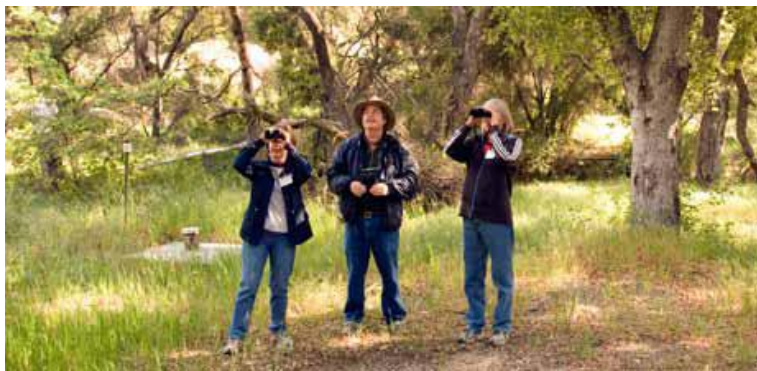
Birdathon team members scout for birds.

To increase its avian knowledge and support conservation efforts, the San Fernando Valley Audubon Society set up a bird banding program at the former field laboratory. The purpose of the study is to gather baseline data and evaluate the effect of demolition and remediation activities on birds. The San Fernando Valley Audubon Society (Audubon Society) is dedicated to promoting bird life appreciation through resource conservation and habitat preservation. "Since Boeing plans to donate