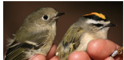
Photo: Ruby-crowned and Golden-crowned Kinglets

Bird identification will be a small part of the program. The emphasis will be on using the resources available to help you develop the skills necessary to become a more successful (less) frustrated birder.