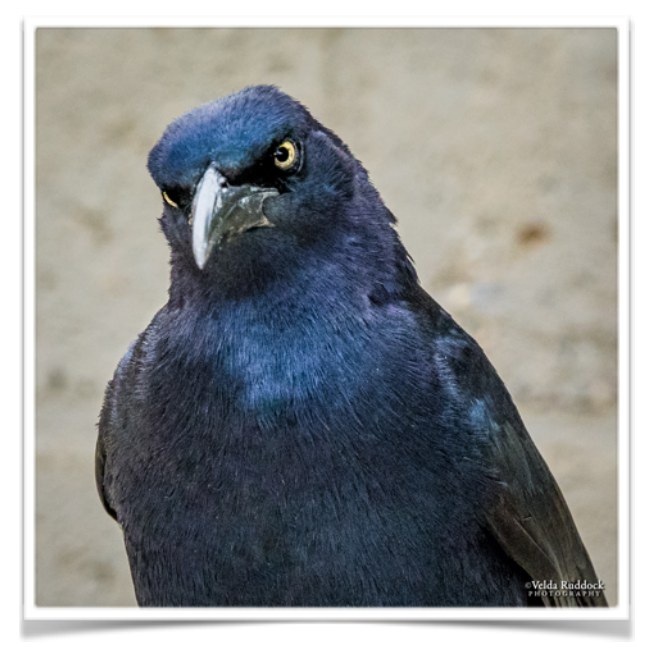
Great-tailed Grackle, Sepulveda Basin, 4/17

Please call me (818) 618-1652 or email me <u>Dave.Weeshoff@SFVAudubon.org</u> with questions or comments.