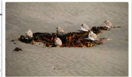
Six Snowy Plovers surround beach wrack, their favorite source of invertebrate prey.