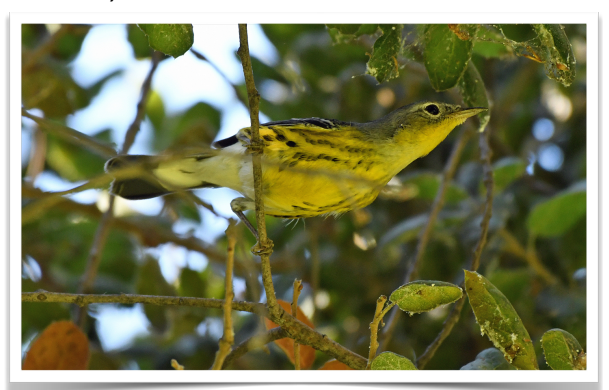
Magnolia Warbler by Alexander Viduetsky

spot. Also, many thanks to Carl, who was extremely helpful with the directions when we were looking together for the Magnolia Warbler earlier that day.