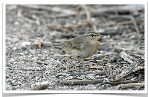
Dusky Warbler

When I arrived to the spot at Sepulveda Basin in the afternoon on October 16, there was already a group of birders there. Thanks to them, I knew exactly where that bird was. It took approximately two hours to get a chance to photograph that Old World warbler in the open. The bird was moving very fast and I had no more than a few seconds to make my photo-shots. Considering that the bird was staying in the shadows most of the time, I had to increase my camera's ISO to 2000 and add 1+ step of exposure compensation to make a sharp enough capture. Even though my photo is far from perfect, it was adequate for the Cornell's Lab application Merlin photo ID (which I have on my phone) to confirm that the bird I had photographed was indeed the Dusky Warbler."